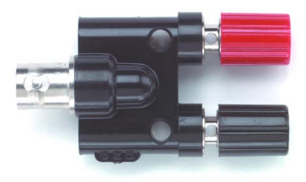
Model 1452 Adapter-Binding Posts to BNC Receptacle