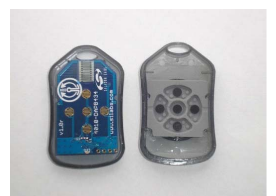
Figure 1. 4010 RKE Universal Key Fob and Plastic Case (P/N 4010-DAPB_434 and MSC-PLPB_1)