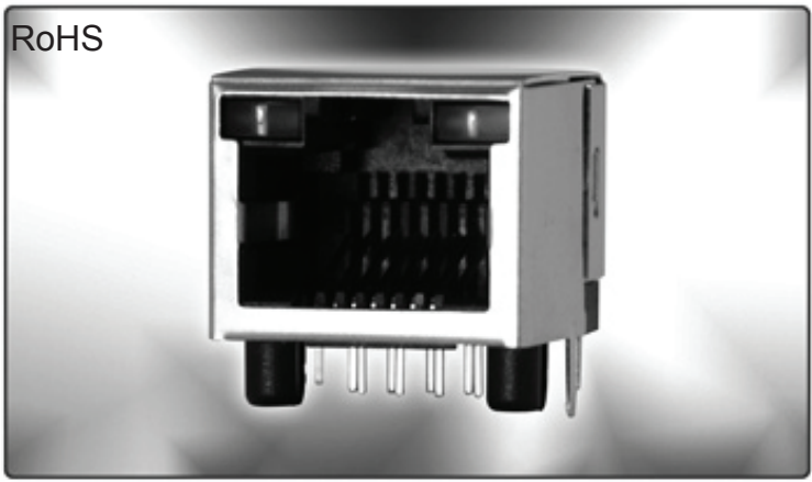
GWLX/GWLX-SMT Series Right Angle Modular Jack with LED, Tab up