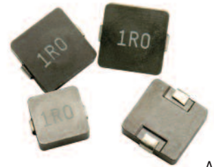
Actual Size (Max.)