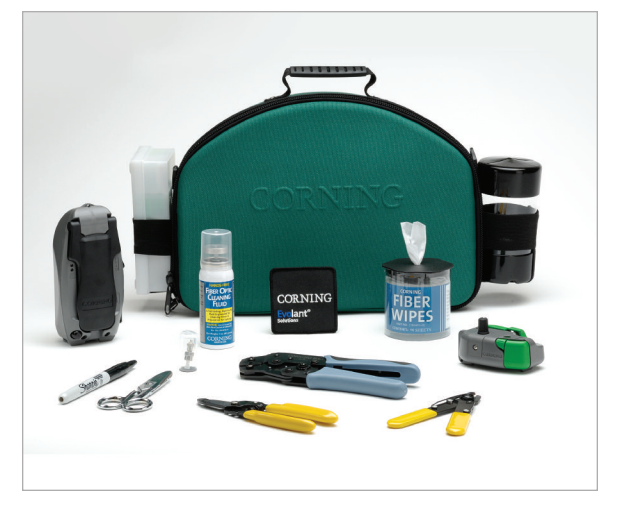
OptiSnap Tool Kit | Photo CCA203