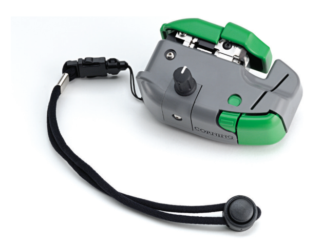
OptiSnap<sup>™</sup> Field Cleaver | Photo CCA206