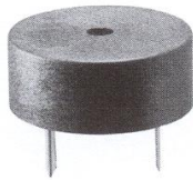
\phi 17.0 \times H7.0