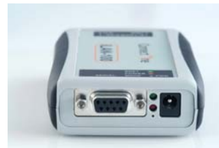
DB-9 Connector, Power Jack, Mode Select, SerialNET and Power LEDs