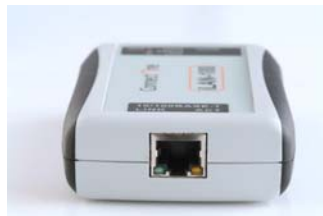
RJ-45 Connector Link and Activity LEDs