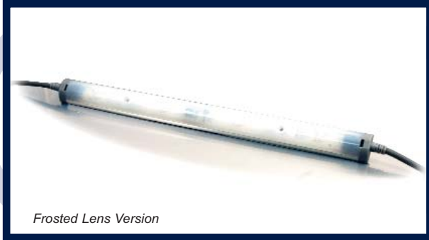
Frosted Lens Version