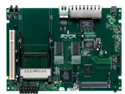
AP/Router Reference Design