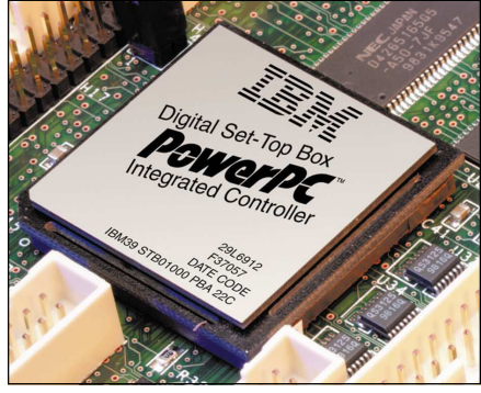
IBM's attractively priced STB controllers deliver high performance in a single chip.