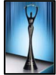
Electra Award 2005