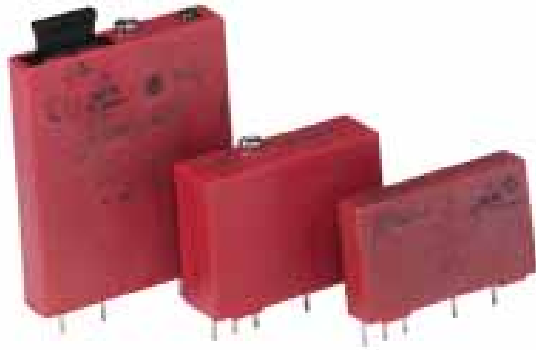
70G-ODC/OAC 70-ODC/OAC 70M-ODC/OAC