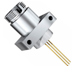
PD070-HL1-5xx FC Receptacle