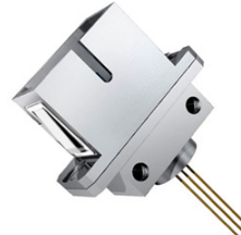
PD070-HL1-5xx SC Receptacle