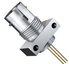
PD070-HL1-5xx ST Receptacle