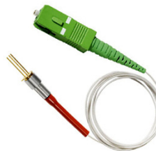
PD070-HL1-3xx SC/APC Pigtail