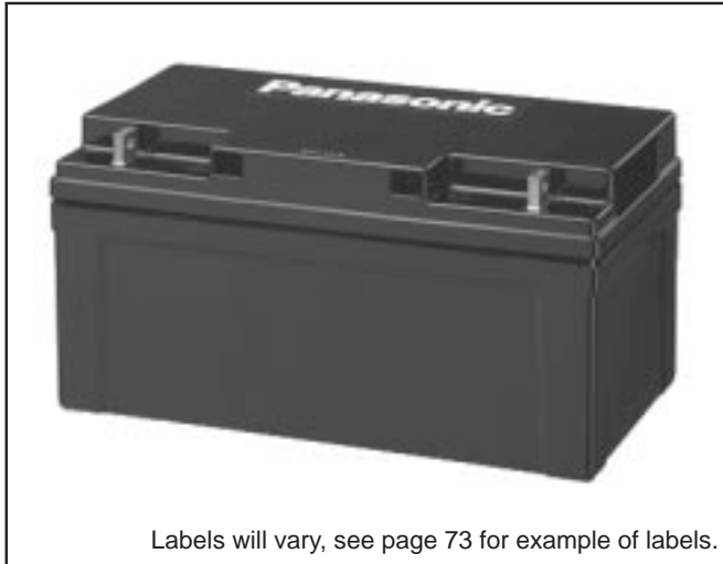
Labels will vary, see page 73 for example of labels.