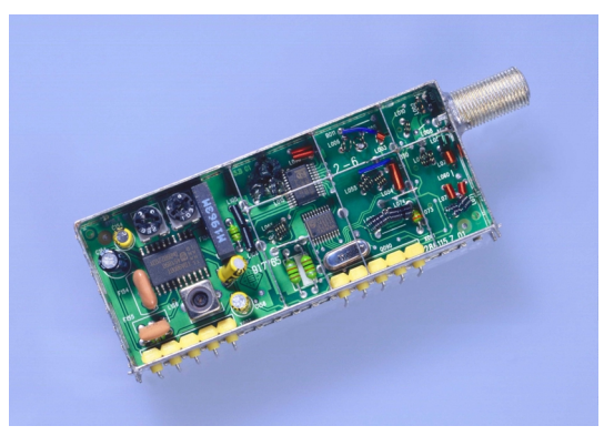
Modules can be implemented with different sockets, filters, interfaces, connectors, and other customizable options within the same pinouts.

The 40x6 Series RF Tuner Modules are complete RF frontend systems specifically designed for multimedia PC/TV applications. The modules contain two primary functional components: a hyperband tuner and an intermediate frequency (IF) section.