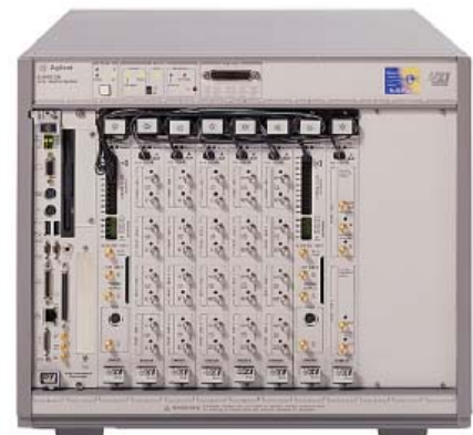
81250 modular BERT platform

* The N1080A-H03 has a socket for an EDID memory but not the actual chip itself.