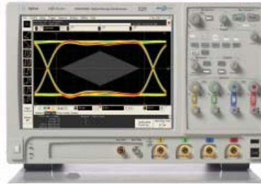
Infiniium DSO90000 oscilloscope

When these TPA's are paired with Agilent's DSO90000 Infiniium oscilloscopes and the N5399A HDMI Compliance Test Software, the user will have uncompromised accuracy and unrivaled simplicity in characterizing their source design. The TPA's excellent performance enables the user to clearly see nuances in the transmitted pattern and determine how to improve the performance of the source and channel.