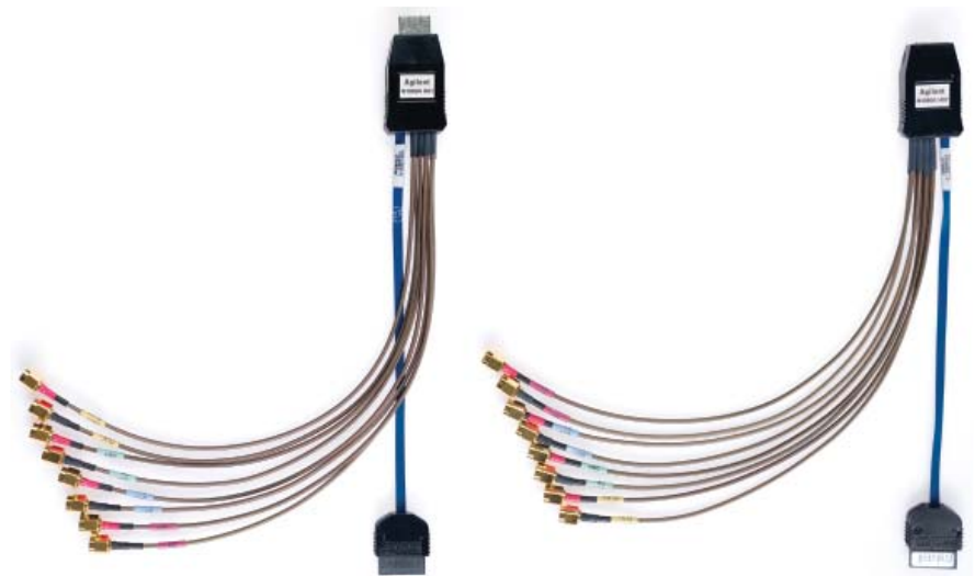
N1080A-H01 TPA with type A plug

Emerging consumer and entertainment equipment provides much higher resolution for user enjoyment. Higher resolutions demand higher communication rates, which place new demands on the source, sink and channel. The N1080A HDMI Test Point Access Adapters provide unrivaled convenience and performance.