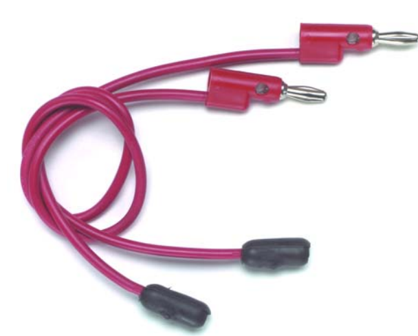
Model 4274 Multi-Stacking Banana Plug Patch Cord with In-Line Fuse Holder