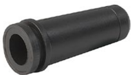
HN 14.45 PVC Strain Relief