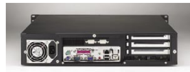
Rear view of ACP-2010MB