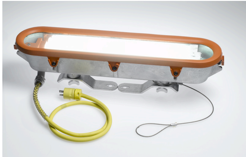
Wide-Area Fluorescent Light For Class I, Division 2 and Zone 2 Applications

For additional product information, please visit: http://www.molex.com/link/widearea.html and http://www.woodhead.com .