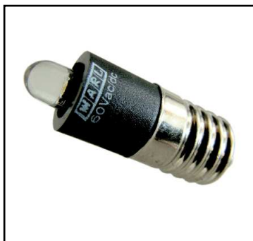
261 SERIES PACK QUANTITY = 20 PIECES