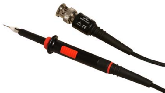
Model 6491 Modular Passive Oscilloscope Probe