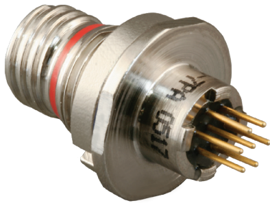
Series 801 Printed Circuit Board Receptacle

These receptacles feature a low profile shell for minimum protrusion inside enclosures. Contacts are non-removable. Connectors are backfilled with epoxy for a watertight seal.