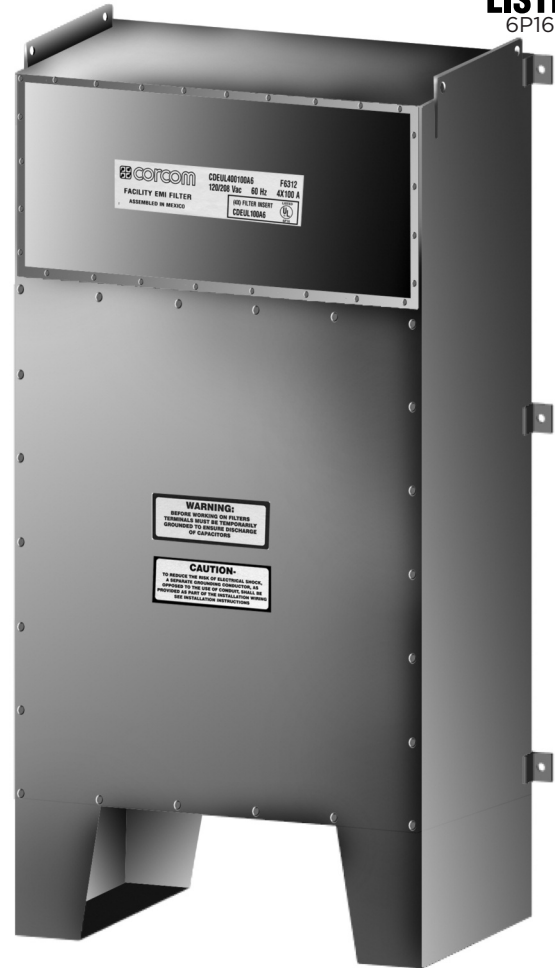
Shown with optional legs