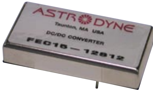
Unit measures 1"W x 2"L x 0.375"H