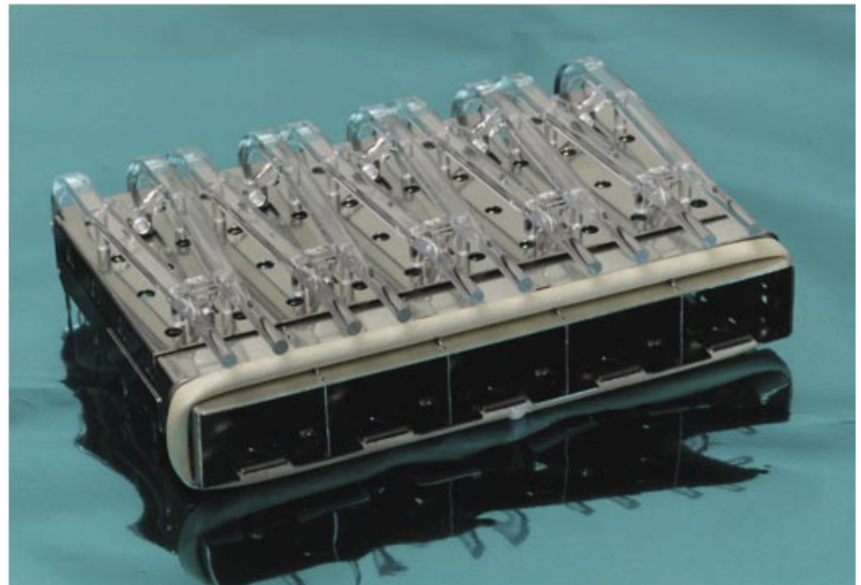
Lightpipe cover mounted on 1-by-5 SFP cage