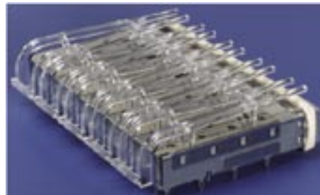
Rear View: 1-by-5 lightpipe cover (Series 74729) on 1-by-5 SFP cage (Series 74723)

Light Pipes: Polycarbonate, V0 Rated Light Pipe Cover: C770 Alloy Operating Temperature: -55 to +105° C