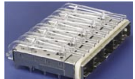
Side View: 1-by-5 lightpipe cover (Series 74729) on 1-by-5 SFP cage (Series 74723)