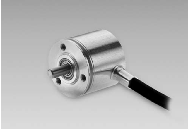
GI320 with shaft