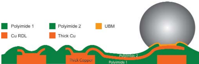
Bump on Thick Repassivation/Redistribution