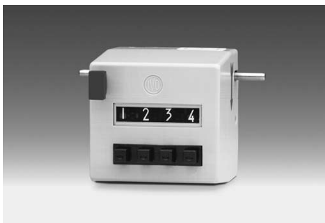
UE102 - Revolution counter