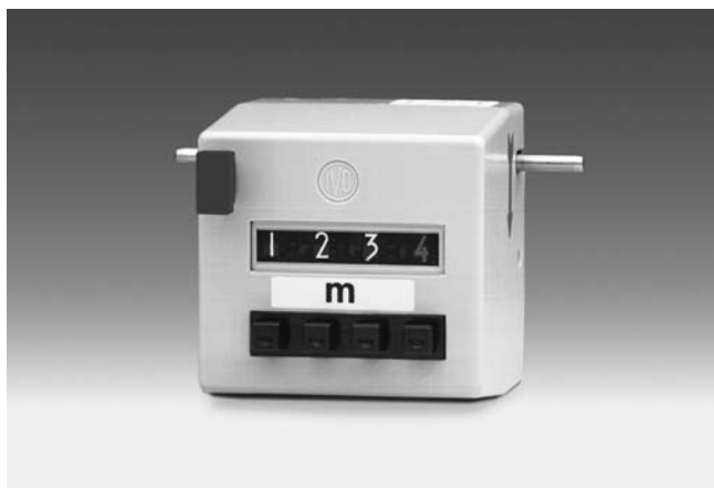
ME102 - Meter counter