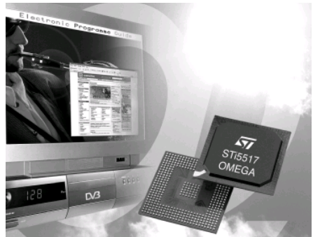
Figure 2. Typical Pay TV application with Modem Return Channel