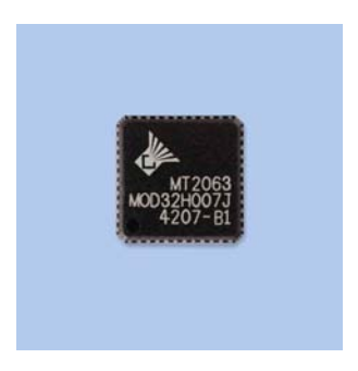
MT2063 Single-Chip Universal Tuner

The MT2063 is a low-power 3.3V singlechip universal tuner for analog and digital worldwide terrestrial and cable standards