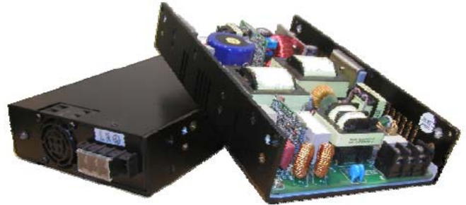
U Type: (U-Chassis): 8(L) x 5(W) x 1.6(H) inches. E Type: (Enclosed with built-in fan): 9(L) x 5(W) x 1.6(H) inches.