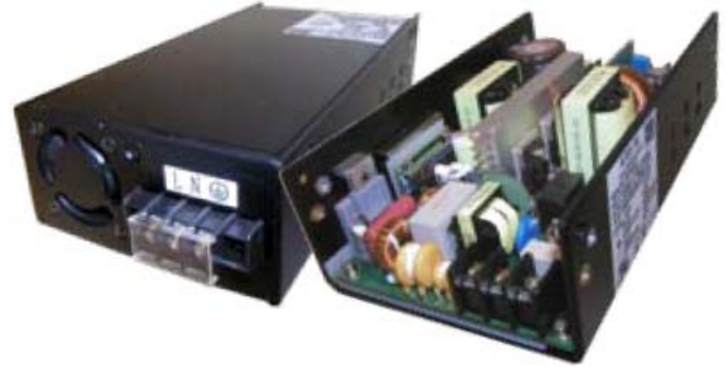
PSRL5016U3 Series: (U-Chassis): 7(L) x 4(W) x 2(H) inches. PSRL5016E3 Series: (Enclosed with built-in fan): 8(L) x 4(W) x 2(H) inches.