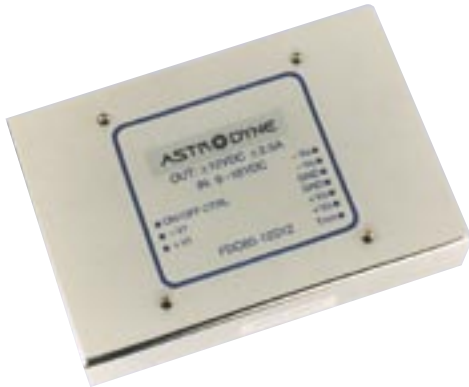
Unit measures 2.76"W x 3.94"L x 0.75"H