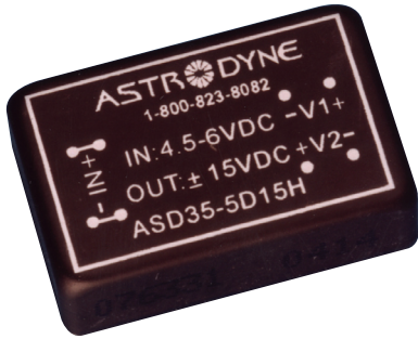
Unit measures 0.8"W x 1.25"L x 0.4"H