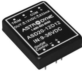
Unit measures 1.6"W x 2"L x 0.45"H