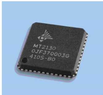
MT2130 Single-Chip Tuner

The MT2130 is a single-chip low-power tuner for analog and digital worldwide television standards.