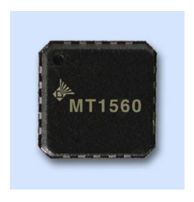
MT1560 Upstream Amplifier

The MT1560 is a 3.3V programmable gain upstream amplifier.