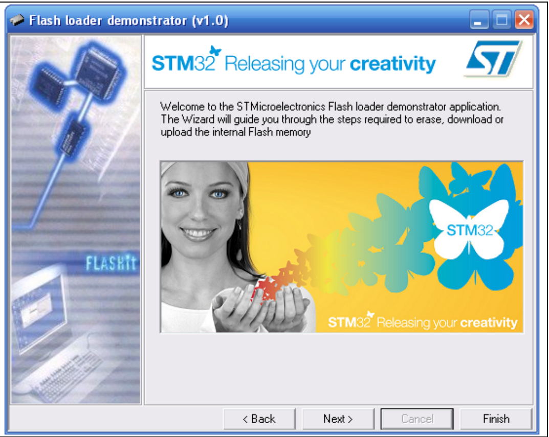
Figure 3. Welcome window

If all is ready click "Next" to continue.