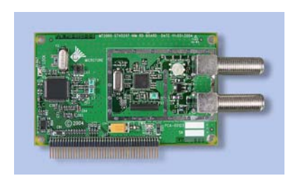
M2060-STV0297-RD DVB-C REFERENCE DESIGN

The MT2060-STV0297-RD is an inexpensive, integrated tuner-demodulator Reference Design solution for DVB-C applications.