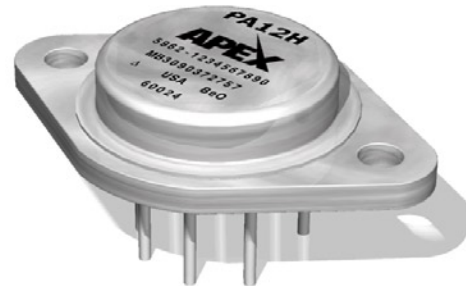
8-PIN TO-3 PACKAGE STYLE CE