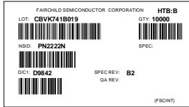
F63TNR Label sample