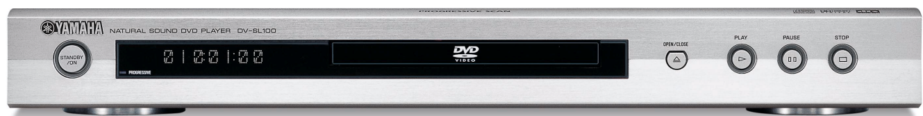
DV-SL100 Progressive Scan DVD Player

If you or anyone in your family enjoys making discs with MP3 files, you'll appreciate the DV-SL100. It provides full MP3 compatibility, including Fast Forward, Rewind and Special Playback functions, MP3 Navigation Display, playback of discs with both MP3 and JPEG files, and JPEG/MP3 Multisession compatibility