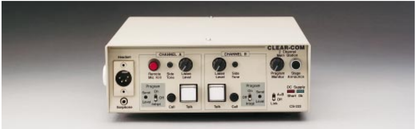
CS-222 Front Panel