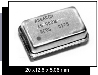
20 x12.6 x 5.08 mm