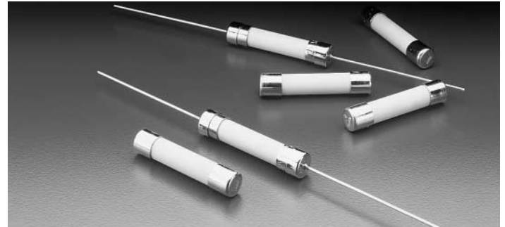
326 000 Series