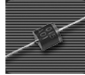
R-6 or P600