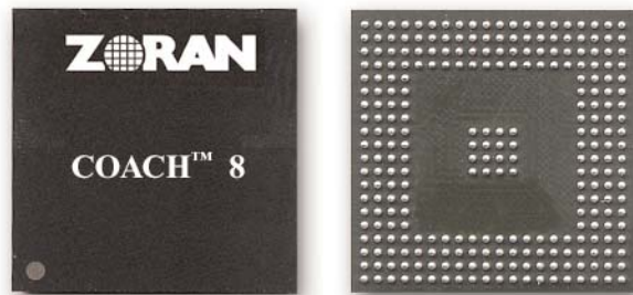
17cm x 17cm

For more information, contact Zoran's Sunnyvale office or the office nearest you: