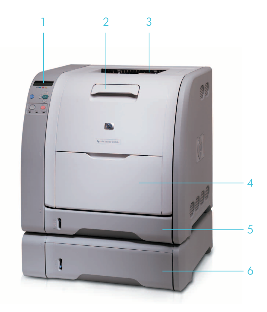
HP Color LaserJet 3700dtn shown

Worry-free printing with a one-year onsite warranty