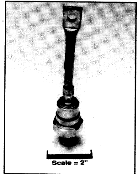
R602__22/R603__22 Fast Recovery Rectifier 220 Amperes Average, 1600 Volts